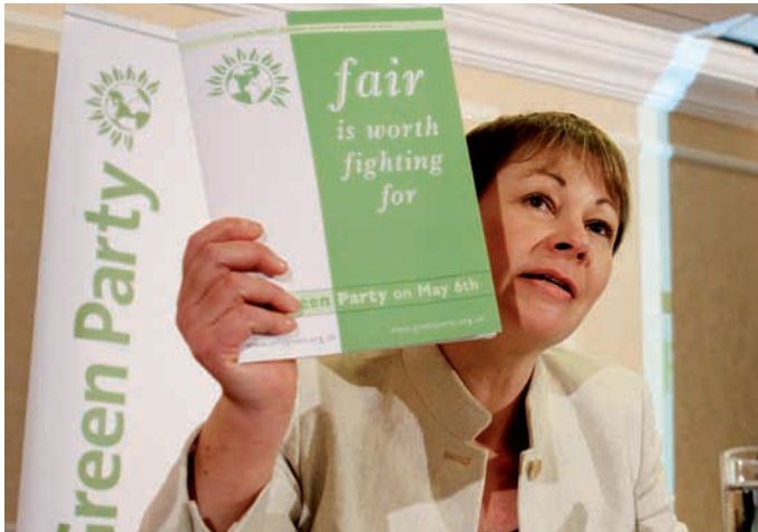
Caroline Lucas became the Green Party's first MP at the May 2010 general election